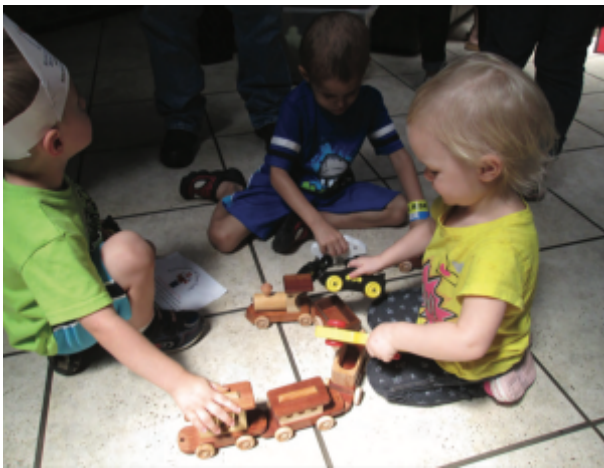
Children at the Ronald McDonald House in Gainesville play with ToyMakers' toys at the July 2015 Birthday Bash

The ToyMakers of East Lake are hard at work all year round, making beautiful toys for children by hand. Their goal is simple. To bring joy to a child, to see a smile spread across that little face, little pudgy hands grasping the wheels and watching them turn. They want to see older children race their car across the floor, or turn their therapy lesson into a game. Their only goal is to make a child happy, if only momentarily, while they're at the hospital, or at a shelter, and to remind them that everything is going to be okay. That's what children need to know when they're going through a scary time, and these volunteers help to create these moments, one